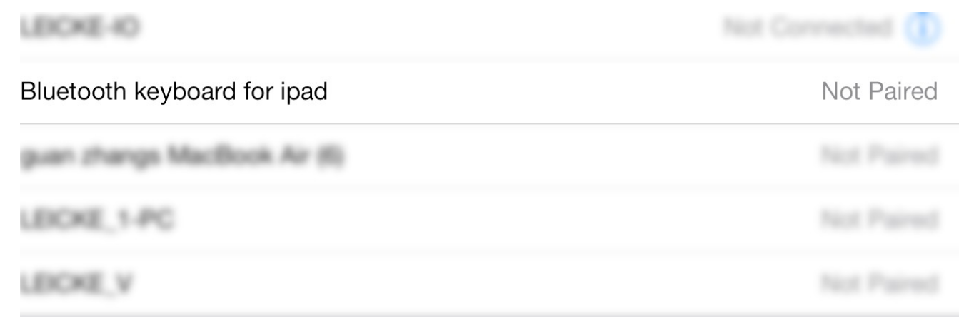
Step 5: The tablet will now display a code to connect. Insert the code via the keyboard and confirm with the Return key. The connection will now be securely encoded.