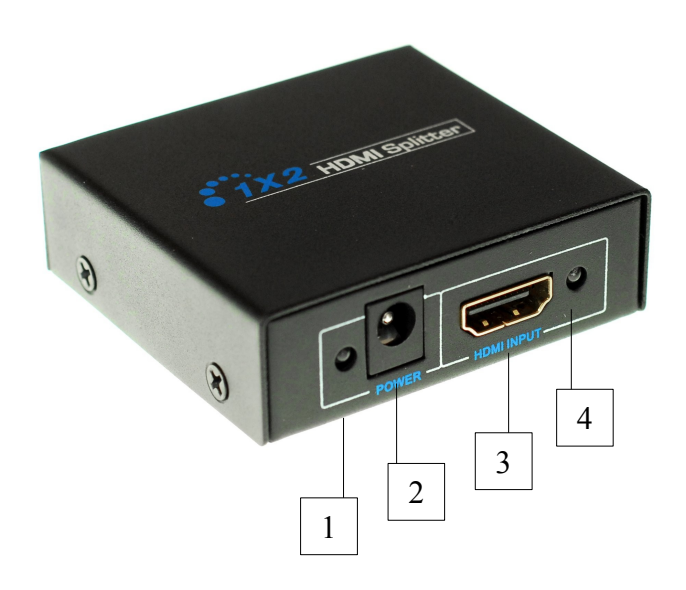
Figure 2: Back Panel