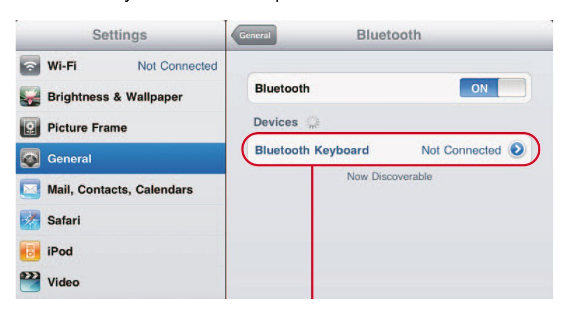
Step 5: Wireless keyboard is found. Tap on the device to connect.